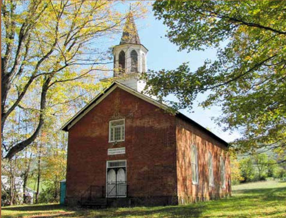
St. John's Chapel, Sweet Springs, West Virginia